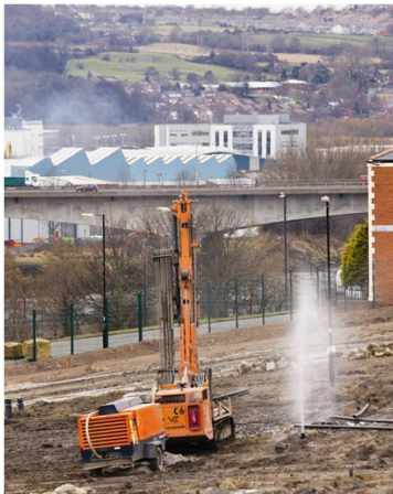
Above: Casagrande C6 Drilling.

Van Elle were appointed by Galliford Try to carry out the mine stabilisation project on an all risks basis tender valued in excess of £2 million pounds making it the largest single mine consolidation project carried out to date in the Northern Coalfield. Whilst part of the site was covered by some historical mine records the majority of the workings pre dated the legal requirement to be recorded and in preparing the bid, Van Elle carried out an extensive desk study researching available site investigation records, old mine and OS plans, archive information and extensive in-house records of previous work carried out in the area.