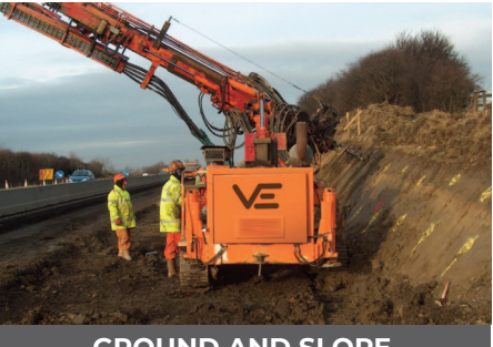
GROUND AND SLOPE STABILISATION

Cable percussion, window sampling, dynamic probing and rotary GI Pile testing, noise & vibration monitoring