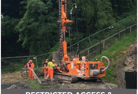
RESTRICTED ACCESS & SPECIALIST PILING

Lorry mounted & restricted access tracked rigs Drilled piles (various techniques) ScrewFast helical and grip piles