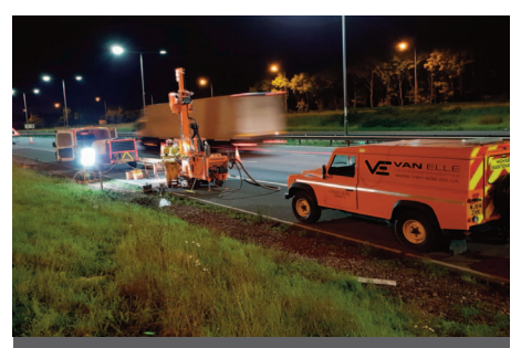
GROUND INVESTIGATION & TESTING

Publicly quoted Group 120 strong rig fleet Over 500 directly employed, specialist workforce 1100 projects per annum