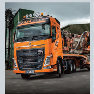
DEDICATED TRANSPORT FLEET