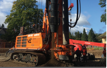
OPEN SITE PILING

Contiguous and secant piled walls Sheet piling and kingpost walls